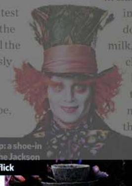
Depp: a shoe-in for the Jackson bio-flick