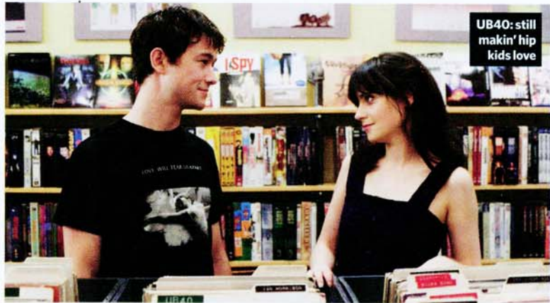
UB40: still makin' hip kids love

2 "Don't refer to us as 'a date'. When you ask women out on dates it makes it so obvious what you are trying to do and women quite often react accordingly. Better to say 'let's hang out' or 'let's get together' instead.