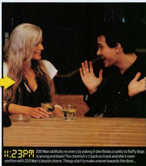
11:23PM ZOO Man skillfully recovers by asking if she thinks cruelly to fluffy dogs is wrong and blam! The chemistry's back on track and she's soon smitten with ZOO Man's boyish charm. Things start to make a move towards the door...