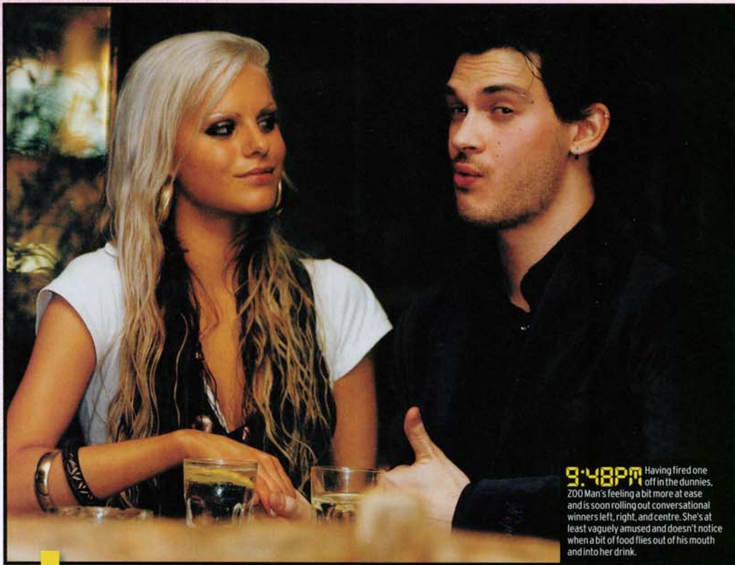
9:48PM Having fired one off in the dunnies, ZOO Man's feeling a bit more at ease and is soon rolling out conversational winners left, right, and centre. She's at least vaguely amused and doesn't notice when a bit of food flies out of his mouth and into her drink.