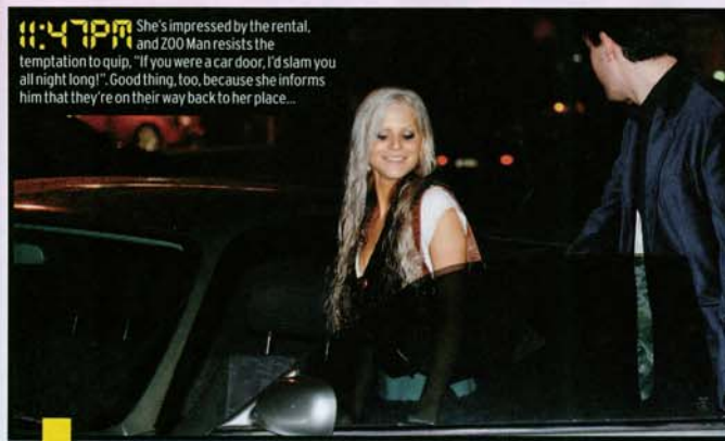
11:47PM She's impressed by the rental, and ZOO Man resists the temptation to quip, "If you were a car door, I'd slam you all night long!". Good thing, too, because she informs him that they're on their way back to her place...